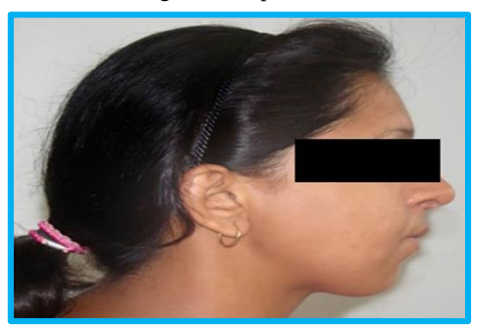
Fig. 5: Post -op lateral view