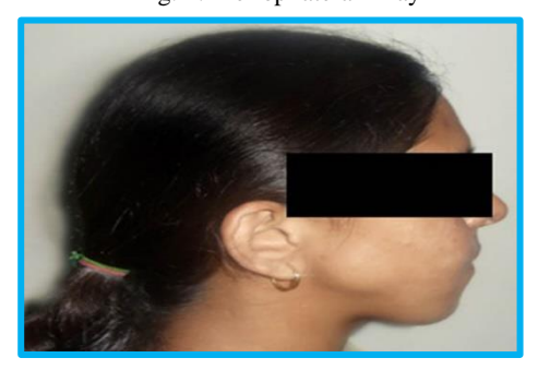
Fig. 4: Pre-op lateral view