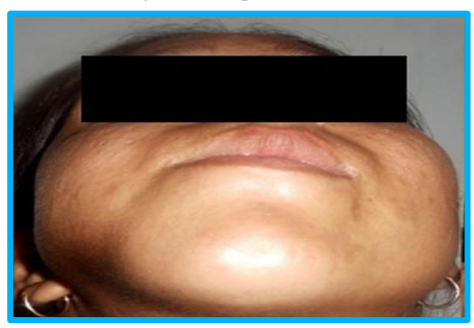
Fig. 6: Pre-op worm's view

according to cephalometrics for orthognathic surgery (COGS) analysis. Grummons analysis was done on P.A cephalogram, the value was 1.5 mm (value for amount required for correction of asymmetry on the right side) (Fig. 1, Fig. 2 & Fig. 3). The patient was taken under General Anesthesia, first the incision was marked intraorally and the site was approached through degloving incision from anterior mandibular premolar to premolar. Exposure of the anterior mandible was done after incising the mucosa and it was undermined, then the mentalis muscle was detached inferiorly towards bone. Sharp incision and reflection of periosteum from the anterior mandible was done after bilateral mental nerves identified. Midline and paramidline orientation lines were inscribed in the bone before performing the osteotomy with a small bur to facilitate repositioning. According to the planned osteotomy site was marked, initially surgical saw